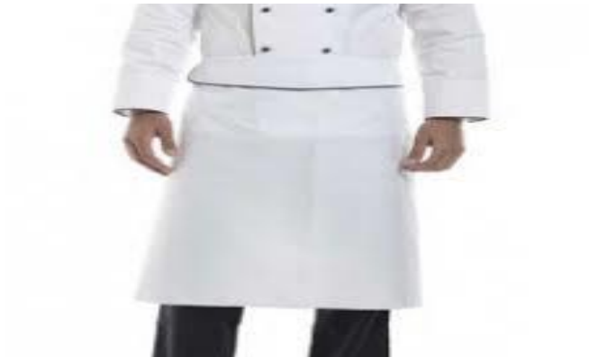
White half Apron