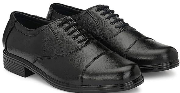
Black round head Oxford shoes (Bata)