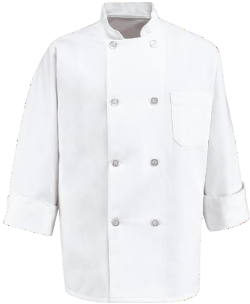
1. Chef Coat-White cotton (white button)