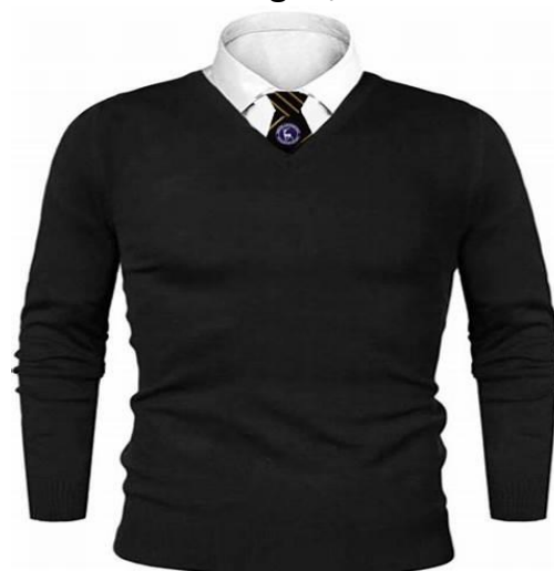
Black Cardigan/ Sweater