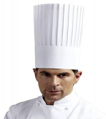
White Paper/Cloth chef cap