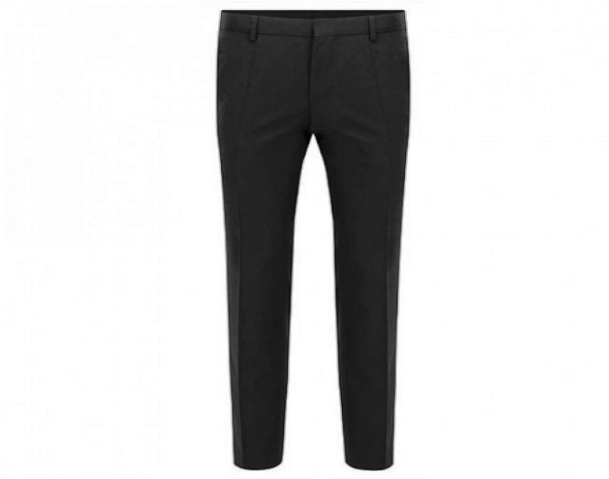
3. Black trouser