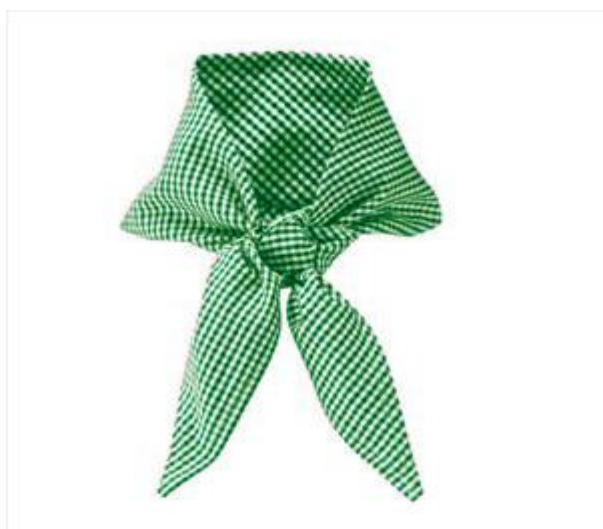
Neck Scarf (Check Pattern)- Green Colour